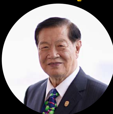
Dr. Henry C. Lee

Office of the Chief's State's Attorney of the CT State Division of Criminal Justice "Domestic Violence: Making Strides Through Collaboration"