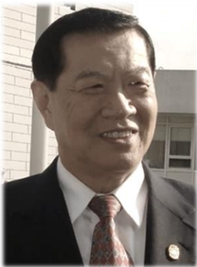
Dr. Henry Lee Emeritus Professor Forensic Science Dept Founder/Director Henry C. Lee Institute Cold Case Consultant